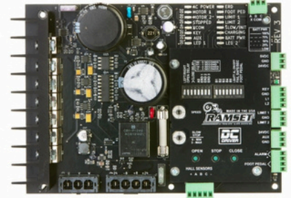
DC DRIVER BOARD

All Ramset DC models use the same two boards